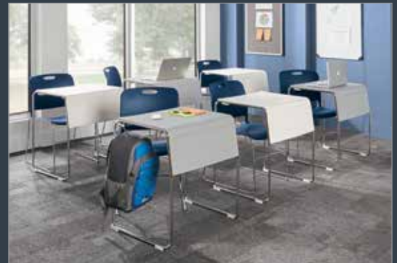
NBF Signature Series — Merge Desks, Zeus Chairs