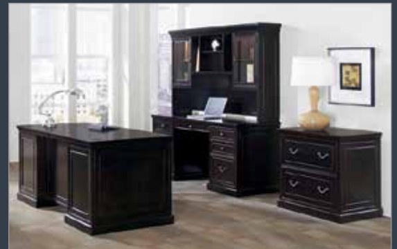
Martin — Fulton Collection

From the ordering process to space planning and installation, we'll be there with you every step of the way, with furniture that works and people who care.