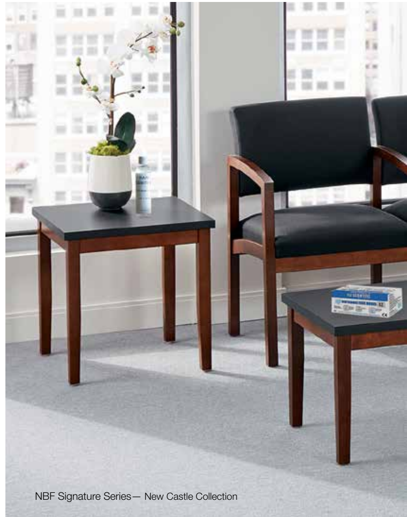
NBF Signature Series — New Castle Collection